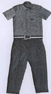
Diagram 4. Boys IX-XII