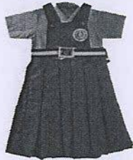
Diagram 1. Girls I-V