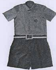
Diagram 2. Boys I-VIII