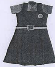
Diagram 3. Girls VI-VIII